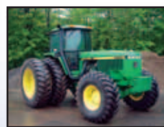
94 JD 4960 4X4

1988 TALBERT TD-35S-HRG-1 , 35 Ton T/A Lowboy, hydraulic non-ground bearing gooseneck, 23'x8' level deck, spring suspension, open over wheels, outriggers, chain dogs, and 255/70R22.5 tires. In good condition with good to very good tires.