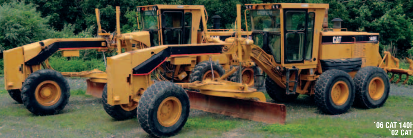
'06 CAT 140H AND '02 CAT 143H

WEDNESDAY, JUNE 22, 2011 - 9:00AM Telford, Pennsylvania (Philadelphia Area)