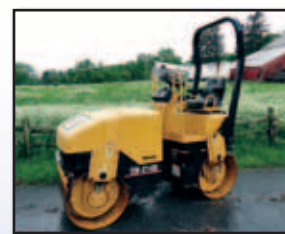
00 CAT CB214D

2000 CAT CB214D Vibratory Tandem Asphalt Roller , s/n ITZ00281, Cat 3013 dsl and hydrostatic trans, 39" smooth drums and roll-bar. In very good condition. (358 Original Hours)