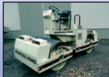
92 IR DD65

1988 EAGER BEAVER SRH300 Tandem Roller , s/n 300SRH880010, Wisconsin 2 cylinder gas and hydrostatic trans, 38" split front drum, 40" rear drums, water system, and 4,200# weight. In fair to good condition.