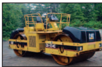
00 CAT CB534C

2000 CAT CB534C Vibratory Roller , s/n 5HN00629, Cat 3054 dsl and hydrostatic trans, 67" smooth drums, dual drum drive, water system, multi-position and operator station. In good condition.