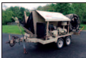
05 FINN BB302

1998 VERMEER BC1230A Chipper , s/n 1VRN15173W1002100, Perkins dsl, 12" capacity disc chipper, Auto Feed II feed system, pintle tow, and electric brakes. In very good condition with very good tires. (236 Original Hours) (Spare Set of Knives)