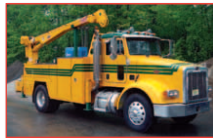
'05 PETERBILT 357