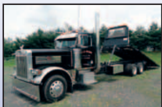
95 PETERBILT 379 ROLL-BACK

2005 PETERBILT 357 Single Axle Service Truck , Cat C-13 Acert, 400HP dsl and Eaton Fuller 10 speed trans, 14'6" service body, 1993 IMT 7025, 14,000# 16'4" - 25'4" 2-stage service crane, Miller Bobcat 225NT, 225 amp/8500 watt welder/generator, IMT hydraulic air compressor, 33,000# rear and 12,000# front axle, single frame, 3-stage Jake brake, 2-compartment lube tank with Graco pumps, hose reels, aluminum Budd wheels, air ride suspension, 11R24.5 front and 12R24.5 rear tires. In good condition with very good tires.