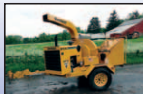
98 VERMEER BC1230A (236 ORIGINAL HOURS)

2005 FINN BB302 Portable Bark Mulch Blower , s/n SDA-807, Kubota V1505, 33.5HP water cooled dsl, 150+/- Foot x 4" discharge hose with hose reel, radio remote control, 1.5 cubic yard feed hopper, Tuthill blower rated 500 CFM @ 10PSI, material delivery rated 10 cubic yard per hour, mounted on tandem axle carrier with pintle tow and 174/80D13 tires. In very good condition with good tires. (732 Original Hours)