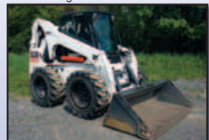
08 BOBCAT S330

2005 CAT 277B Crawler Skid Steer Loader , s/n MDH02791, Cat dsl and hydrostatic trans, hydraulic 4-in-1 bucket, EROPS, and 18" rubber tracks. In good condition with good undercarriage.