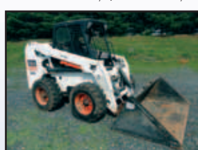
09 BOBCAT S220

2005 CAT 262B Crawler Skid Steer Loader , s/n PDT01568, OROPS • 2005 TAKEUCHI TL140 Crawler Skid Steer Loader , s/n 21402039, OROPS