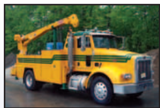
05 PETERBILT 357

sion, ac, power and heated mirrors, power windows, (3) stabilizers, 11R24.5 front and 12R24.5 rear tires. In good to very good condition with very good tires.