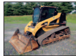
05 CAT 277B

BRADCO 611 Backhoe Attachment • GLENMAC M-6, 6' Hydraulic Soil Conditioner , skid steer quick disconnect mount and transport wheels • 48" Fork Attachment (Fits T300) • UNUSED VERSATECH Skid Steer Attachments: (4 Sets) 48" Pallet Forks • (2) Fork Frame Attachments • 78" Snow and Mulch Bucket • 72" Rock Bucket • 60", 66", and 72" GP buckets • Stump Bucket and (2) Grapple Buckets • (2) Hay Spear Attachments • (4) Quick Tach Mounting Plates • UNUSED VERSATECH Excalibur X36 Thumb Attachment (Fits Mini Excavators) • GROUSER PRODUCTS 72" Quick Attach Blade (Skid Steer) • BOBCAT 30C Hydraulic Post Hole Auger , with 12" and 36" auger bits • 12" and 18" Digging Buckets (Fits 435H-G)