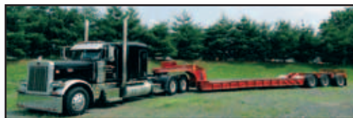
06 PETERBILT 379 AND 88 TRAILING 50 TON

(2) 1997 SNORKEL ATB-A60RFO , 60' Telescopic, 4 cylinder LPG gas and hydrostatic trans, 4-wheel drive and 600# hydraulic positioning platform. In good condition with good tires. 1995 SNORKEL ATB-60ALCU , 60' Articulated Boom Aerial Lift, s/n 9511410495, Cummins dsl and hydrostatic trans, 4-wheel drive, 30"x92" 500# hydraulic positioning platform, and 15x19.5 tires. In good condition with good tires.