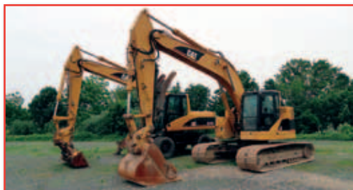
'04 CAT 321CL-CR AND '06 CAT M318C

WEDNESDAY, JUNE 22, 2011 - 9:00AM Telford, Pennsylvania (Philadelphia Area)