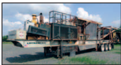
03 LIPPMANN 4800 IMPACT CRUSHER

2003 LIPPMANN 4800 Portable Impact Crusher , s/n 2003-12111, Cat C-12, 425HP dsl, Lippmann 4248LP horizontal shaft impactor, 47x16 VGF, 47"x16" vibrating feeder with 4" grizzly, 48" rear discharge conveyor, (2) 20" cross conveyors (1 missing belt), Honda 8HP auxiliary hydraulic power pack, tri-axle carrier with 11R22.5 tires. In good condition with good tires. (Belts Fair)