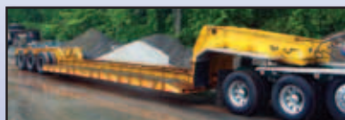
86 TALBERT 75 TON DOUBLE DETACHABLE

2000 PETERBILT Tri-Axle , wetline kit, double frame, air ride suspension, aluminum wheels and headache rack, 275" wheelbase, 237" BBC, and 12R22.5 tires.