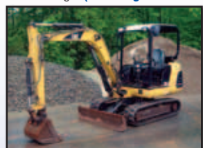
02 CAT 302.5

2008 BOBCAT 435H-G Series Mini Excavator , s/n AACD11043, Kubota 49HP dsl and 2-speed hydraulic drive, 4'6" dipper stick with hydraulic beyond, swing boom, 24" bucket, 76" backfill blade, EROPS with ac, and 16" rubber tracks. In very good condition with very good undercarriage. (109 Original Hours)