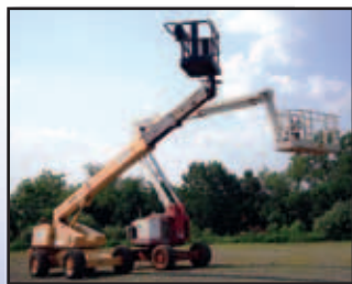
(2) OF (7) 60' AERIAL LIFTS

platform, and 15x19.5 tires. In good condition with good tires. 1998 TEREX TB60 , 60', s/n 98630272 (Upper Control Problems; Electric Problem) • GROVE MX66BXT , 60' Telescopic, s/n Unknown (No Upper Controls; Electric Problem)