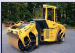
08 BOMAG BW151AD-4AM (13 ORIGINAL HOURS)

2008 BOMAG BW151AD-4AM Vibratory Tandem Roller , s/n 101920271010, Deutz dsl and hydrostatic trans, 66" smooth drum with hydraulic edge compaction roller and cutter wheel, Asphalt Management automated compaction control system with e-vibe, 2-frequency vibration, front and rear spray systems, EROPS, and work lights. In Excellent condition. (13.5 Original Hours)