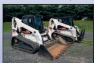
08 AND 06 BOBCAT T300'S

2008 BOBCAT S330 Skid Steer Loader , s/n A02040209, Kubota dsl and 2 speed hydrostatic trans, 80" GP bucket, Power Bob-Tach coupler, hi-flow hydraulics, selectable joystick controls, radio remote control ready, EROPS with ac, and McLaren Nu-Air 36.5x14-20 cushion/solid tires. In very good condition with very good tires. (686 Original Hours)