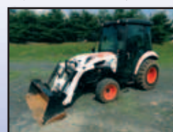
09 BOBCAT CT335B 4X4

2009 BOBCAT CT335B , 4x4 Utility Tractor, s/n ABH811198, Kubota 38HP