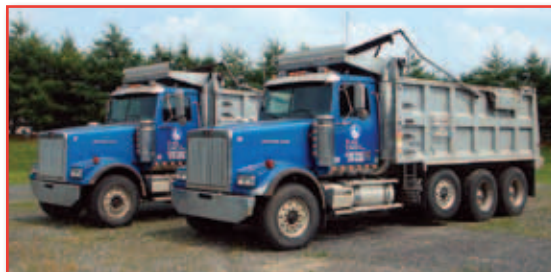
'06 WESTERN STAR 4964