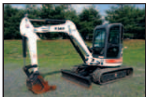
08 BOBCAT 435H-G

good condition with good undercarriage. (1,397 Original Hours)