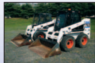
96 AND 94 BOBCAT 763C

1996 BOBCAT 763C Skid Steer Loader , s/n 512217227,