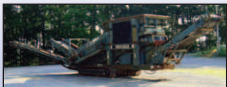
06 POWERSCREEN 1800 TITAN

2006 POWERSCREEN 1800 Titan Crawler Screening Plant , s/n 12101333, Deutz dsl and hydraulic drive, 6'x16' double deck vibratory screen, 35" bolt feeder, 36" radial stacking discharge conveyor, 48" collecting conveyor, 48" tail conveyor, (2) 35" side discharge conveyors, removable catwalks, remote control, and 9.5' overall width. In good to very good condition with good to very good undercarriage. 1996 POWERSCREEN STD Chieftain Portable Screening Plant , s/n 5008144, Cummins dsl, feed hopper with hydraulic grizzly feeder, 36" charging conveyor, double deck vibratory screen, (2) 26" side discharge conveyors, 36" rear discharge conveyor, and 12R22.5 tires. In good condition with good tires.